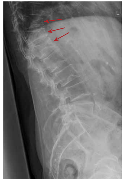
Figure 2. Vertebral crush fractures (arrows).

Why then in the field of osteoporosis medicine do we walk in a minefield of misnomers? BMD is not density (but mass per area), and osteoporosis is both a disease and a risk factor. To be fair, it could be argued that at the time that BMD was being investigated for its ability to predict fracture it was a novel concept to measure a risk factor that was diminishing rather than increasing. Elevated blood glucose, blood pressure or cholesterol levels could theoretically reach any peak level well above that which was considered normal, but no patient could have no bone. There had to be a threshold beyond which the skeleton could no longer support itself. However, investigators have